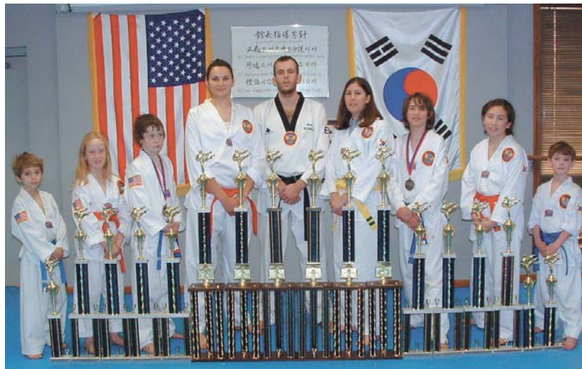
Our Students are Tournament Champions as well as Champions of Life!

(free uniform with enrollment) or Call Now for a Free Trial Lesson with No Obligation!